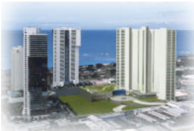
Hawaiki Tower, Nauru Tower, and the impending Koolani Tower