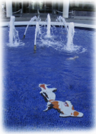
Newly Renovated Circular Driveway Fountain